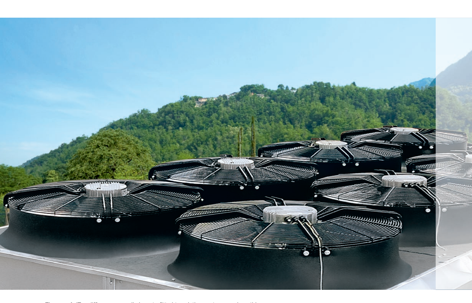
The new AxiTop diffuser can easily be retrofitted to existing systems such as this one.

How can we go one better? Literally with a plug-on diffuser which diverts the airflow in the right direction after it has exited the fan. This is where the greatest potential for optimising noise behavior and efficiency can be found – potential which until now has hardly been tapped. With the AxiTop diffuser, you can now use this potential for your cooling and refrigeration applications – in the simplest manner feasible: plug on and benefit.